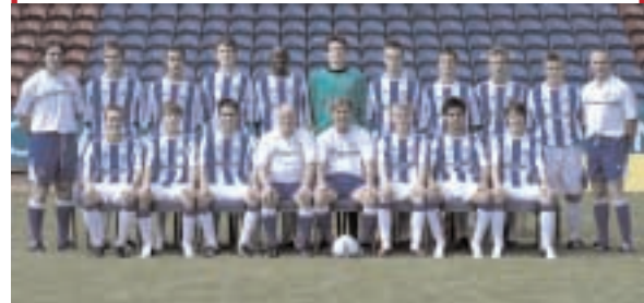
Stars of the Future (above) - Huddersfield Town Academy Squad 2005/06