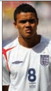
England stars Darren Bent (top) and Jermaine Jenas (above) both progressed through youth programmes at League clubs.